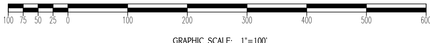
GRAPHIC SCALE: 1"=100'

□ - DENOTES 4" WOODEN OAK LATH SET ON PROPERTY LINE